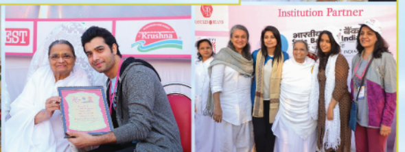
Pan Asia - Women Empowerment & Girl Child Protection Campaigns