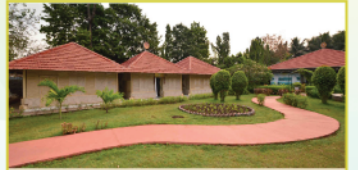
Re-Development of Marshy Land into a Beautiful Re-recreational Park - The Peace Park