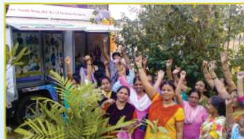
Pan India De-addiction Drives through Awareness Campaigns