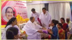
Providing Ration Kits and day-to-day required commodities to the Blind and Disabled