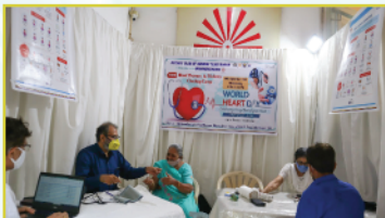
Organizing Yearly Free Health Check-up Camps, Blood Donation Camps, Diabetes Camps etc